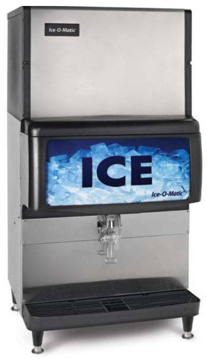
ICEO400 ON IOD200