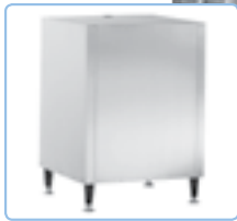
Optional Stand - GDS5